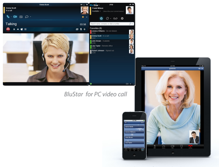
BluStar for PC video call

The open standards of the BluStar for PC allow for interoperability with Microsoft Lync. The BluStar for PC also integrates with LDAP, AD or Personal Outlook directories, making contact-finding a simple task.