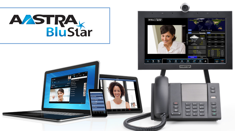
BluStar for PC, iPhone and iPad