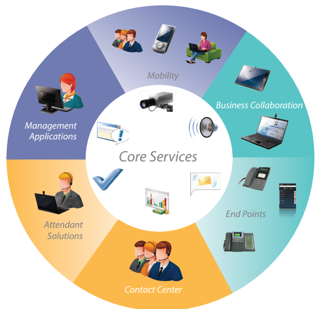
MX-ONE solution overview

Interactive Voice Response (IVR) technology automates interaction with callers and is one of the most powerful telephony applications available today. Enterprises are increasingly turning to IVR to automate, and hence reduce, the cost of common sales, service, inquiry and support calls to and from their companies.