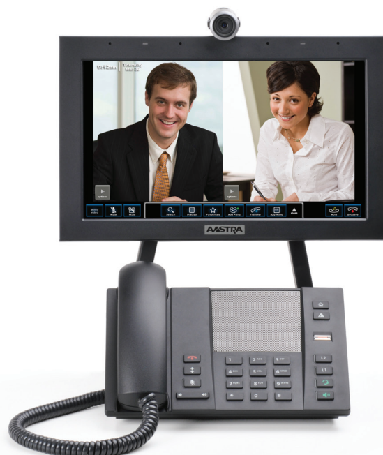
BluStar 8000i Media Desktop Phone

Presence data that is provided to the BluStar end-points is aggregated from different sources through the Aastra BluStar Server.