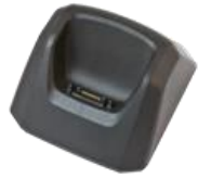
Existing DC3-AAxB Supports Ascom d81