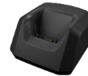
DC3-AAxD Supports Ascom d83 only