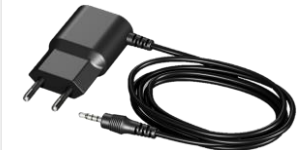
Charger cable 660-672* Supports Ascom d83 only