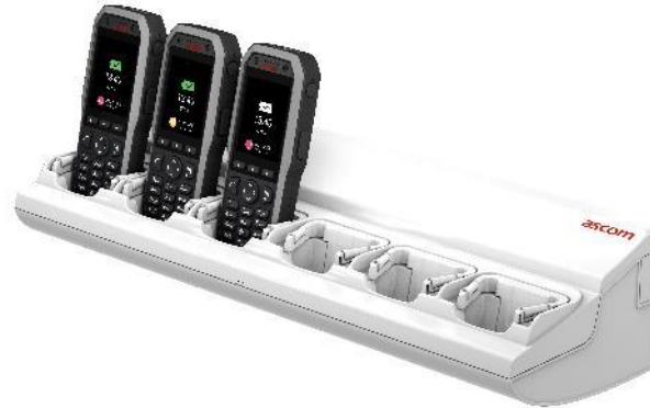
Existing CR3-AAAC, CR3-ABAC, CR3-AAAD, CR3-ABAD The d83 handset is compatible with the existing Ascom handset charging racks