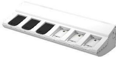
Existing CR4-AAAB Supports Ascom d81 batteries (not for EX variant batteries)