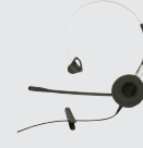
Headset "mic on boom" with QD, BIZ 2400 II for Myco 3, requires adapter 660515 Art. no. 660508