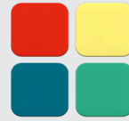
Color stickers for clip for Myco 3 and Myco 4 Art. no. 660579