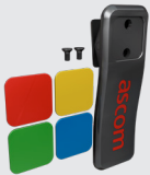
Ascom Myco 4 Standard clip Art. no. 660730