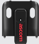
Myco 3 Cover rear, with clip Art. no. 660585