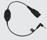
Headset adapter with QD 3.5mm for Myco 3 Art. no. 660515