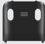
Myco 3 Cover rear, no clip Art. no. 660580