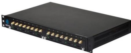
DWG2000F-16G/C (Standalone Antennas )