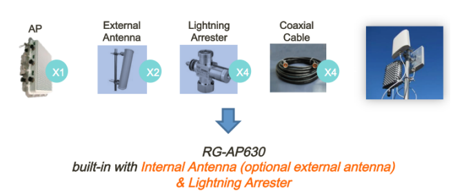
All-in-one Installation Package

The RG-AP630 Outdoor AP Series offers you a one-stop installation package. Everything you need is included, from external antennas to lightning arresters and coaxial cables, for effortless outdoor deployment.