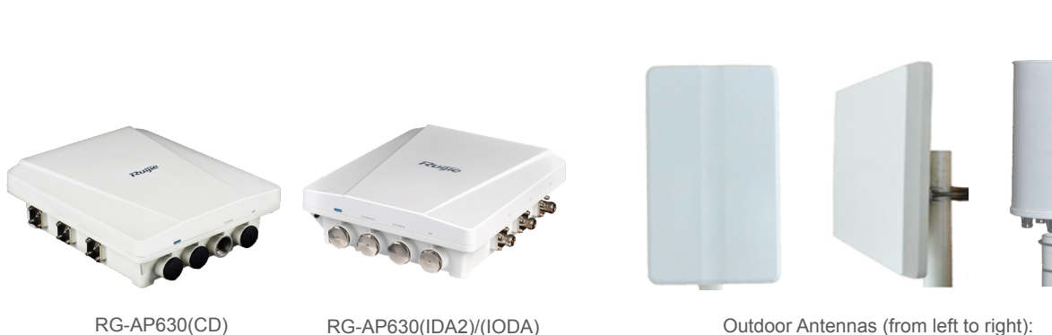
Outdoor Antennas (from left to right): RG-ANTx3-2400D, RG-ANTx3-5800D & RG-ANTx3-2400&5800(O)

The industrial-class AP enclosure (IP67 rated) can withstand extreme outdoor conditions and hence simplify device installation and maintenance. The RG-AP630 (IDA2) is built-in with directional antenna while the RG-AP630(IODA) offers internal omnidirectional antenna. An extensive collection of external antennas is also available to overcome various deployment challenges. Both AP models support automatic switching between the external and internal antennas. RG-AP630 (CD), equipped with built-in directional antenna, can achieve the outdoor Wi-Fi coverage under extreme outdoor conditions in vast majority of the scenarios. Multi-hop and point-to-multipoint wireless bridge features further enhance the deployment flexibility. The RG-AP630 Outdoor AP Series thereby offers unparalleled productivity in a wide variety of outdoor networking solutions.