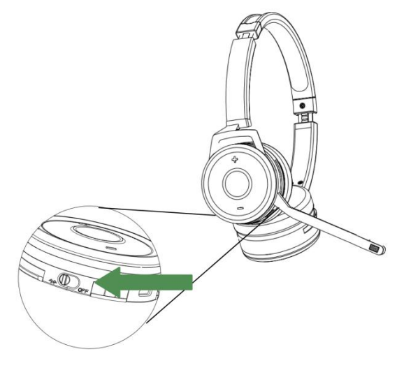
Hold (2 secs) the On/off/connect switch in the connecting position