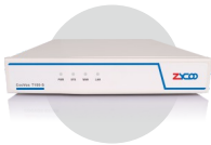
IP PBX T100S(1PCS)

Thank you for purchasing ZYCOO IP phone system. These are the items Included with your IP phone system purchase: